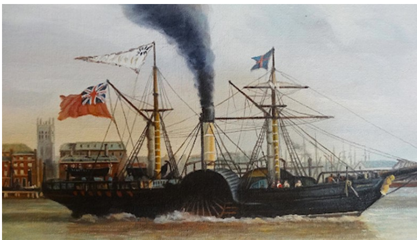
The SS Forfarshire