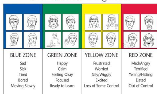
The ZONES of Regulation®

In these weekly lessons, the children will learn about managing safety and risk; and after the half term, they will look at healthy lifestyles. We will also have the inspiring and hard hitting talk from the Two Johns on online safety as preparation for transition to secondary school. In addition, there will be the Crucial Crew day later in the term, which helps children learn how to stay safe in the challenging situations they will come across as they get older. This is a day that usually triggers plenty of questions and discussions at home. The children will also complete the SRE unit with their class teacher this term.